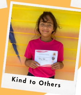
Kind to Others