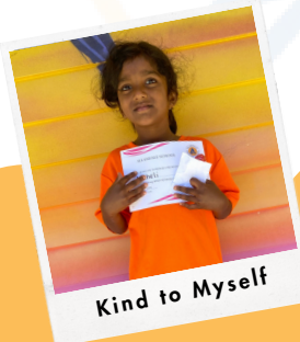
Kind to Myself