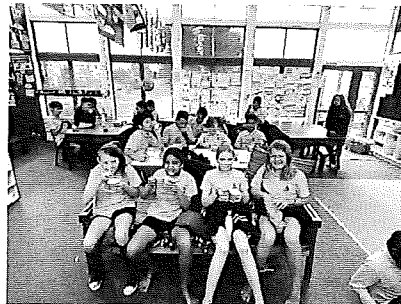
Room 1 students enjoying their Free and Healthy School lunches.